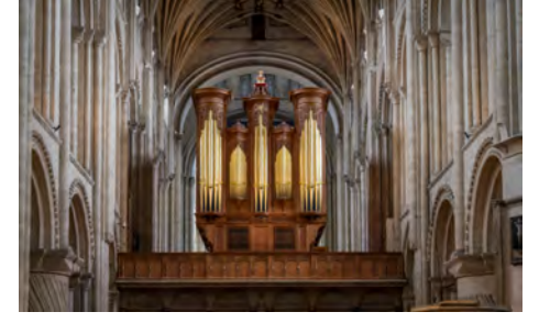
Norwich Cathedral organ which has been recently refurbished

Organ reborn! Join us for a series of three concerts in November 2023 to celebrate the rebuilding of the Cathedral organ: