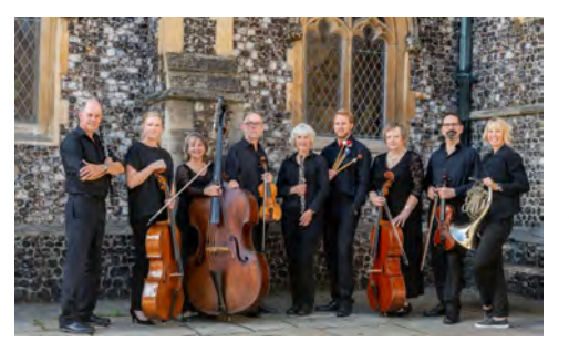
Academy of St Thomas 2019

The Academy of St Thomas was founded in 1973 and has been promoting high calibre concerts in the region ever since. The players of the Academy are drawn from professional musicians and peripatetic teachers who donate their talents in order to play in a high-standard orchestra. Concerts have been acclaimed for their high professional standards and exhilarating performances.