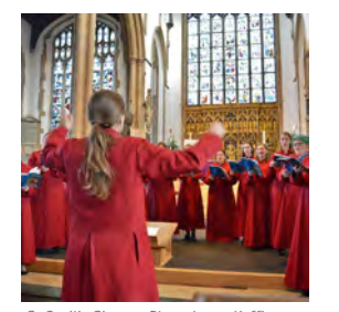
St Cecilia Singers.

The city church of Umeå, Sweden, concert at St John Maddermarket Church, Pottergate