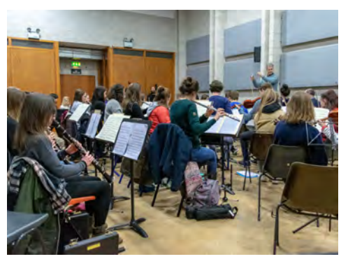
UEA Open Rehearsal