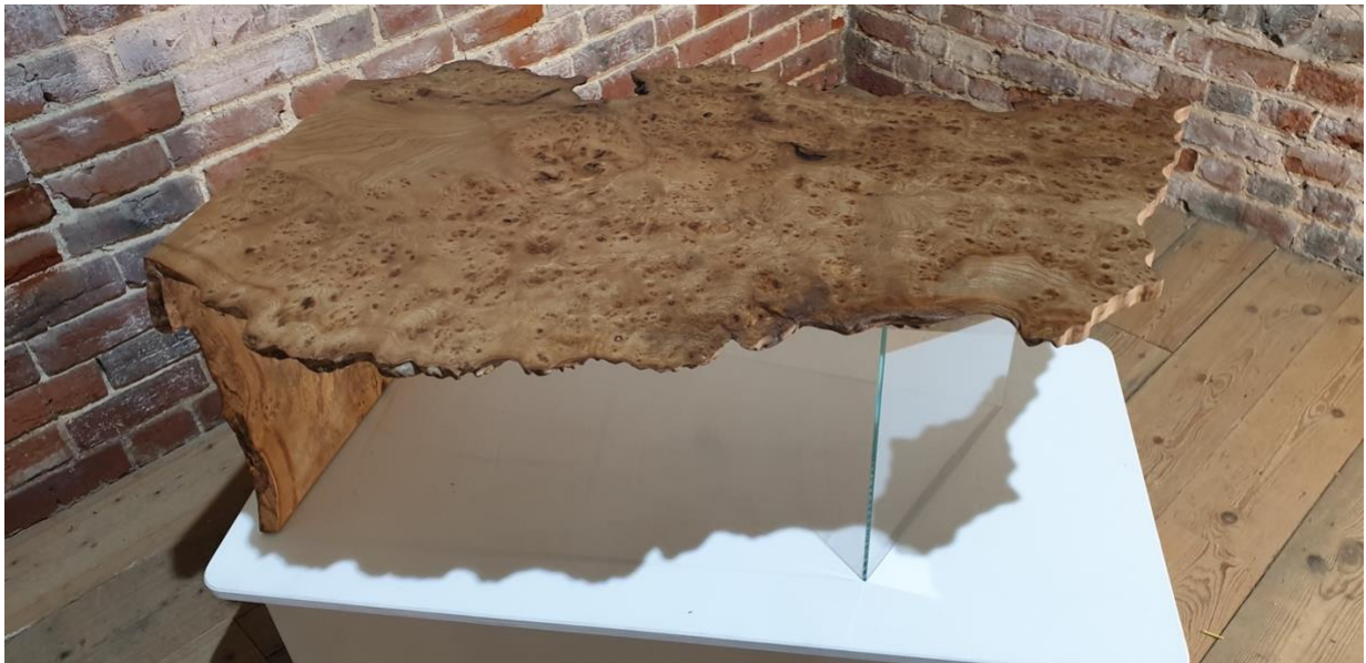
Arboretum Gallery

“Our artist's focus is on producing contemporary furniture while maintaining traditional techniques and quality, while the gallery hopes to shine a light on an often overlooked form and medium in artistic expression.”