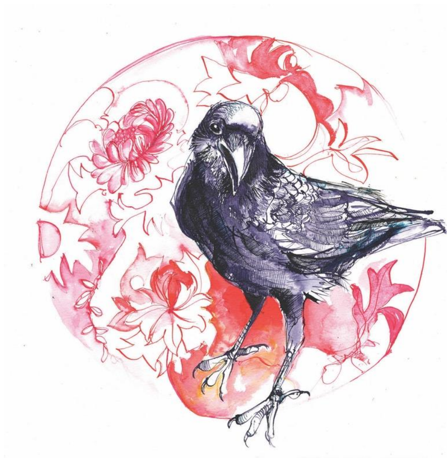
Pink Crow by Rachel Collier-Wilson

“My work will include a number of images centred around corvids. Throughout lockdown, I observed crows flitting between properties on the roof tops, and imagined they were our connections with others, passing between households, messages about activities and talk of cancelled plans. There was communication within communities 'as the crow flies' so to speak, telling tales of our journeying through difficult and challenging times.”