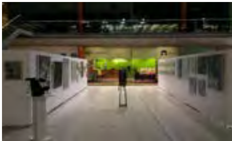
Private view of LAC show at The Forum, July 2014

2014 continues to be a successful year for the eclectic group of painters, sculptors, printmakers, and photographers that comprise The Lonely Arts Club.