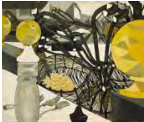
Fish and Chip Shop in Chelsea 1952, Nan Reid, Arts Council Collection, Southbank Centre, London © Estate of the artist. All Rights Reserved, DACS.

AFTERYEARS: REFLECTIONS ON BRITISH ART 1946–52