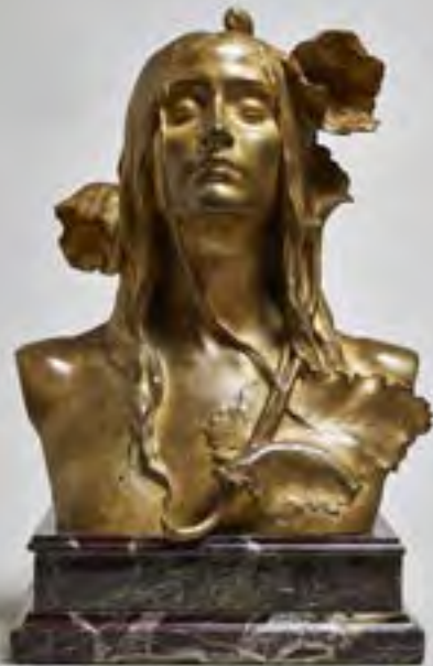
Image : Maurice Bouval (1863–1916) Sleep or Woman with Poppies, 1900, Arwas Archives

SAINSBURY CENTRE for Visual Arts www.scva.ac.uk