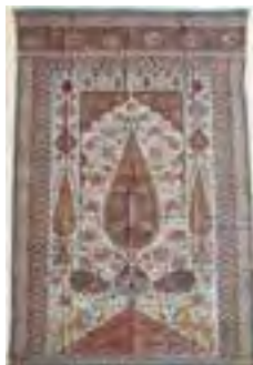
Block printed cotton panel, late 19th C. Patna School. c.1830

The Old Skating Rink Gallery (Country & Eastern) 34-36 Bethel Street, Norwich, Norfolk, NR2 1NR Tel: 01603 663890 Email: info@sadacc.co.uk