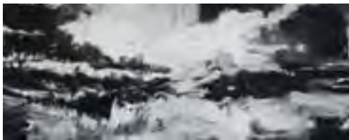
John Virtue, No. 8, 2011–2013, acrylic on canvas 1.8m h x 5.5m w

This exhibition celebrates the four monumental relief sculptures by Henri Matisse, known collectively as The Backs , on loan from Tate. The Backs were Matisse's largest sculptures and, over a period of twenty years, he progressively refined the original pose, based on a woman leaning on a fence looking away from the viewer.