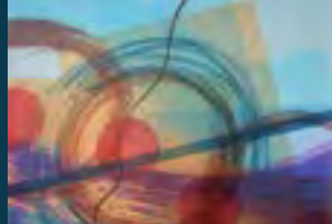
Cover: Detail from Deep Seas by Brigitte Hague