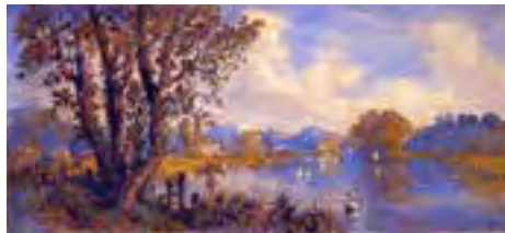
John Joseph Cotman, A Composition, c.1860s, pencil, watercolour and bodycolour

This bicentenary exhibition celebrates the highly original use of colour that made this artist, son of John Sell Cotman, such an innovative member of the 19th century Norwich art scene.