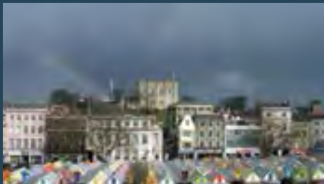
View of Norwich from City Hall towards Norwich Castle

Norwich is a medieval city which, in its hey-day, rivalled London in terms of size and was for many years England's second city, being only 100 miles from the court of London. It was a wealthy city with its fame built on textile trade, weaving and particularly wool. Nearly half of the population was French, Dutch or Flemish and engaged in the weaving trade – hence the name of the football club, the Canaries, called after the birds which the weavers kept for company.