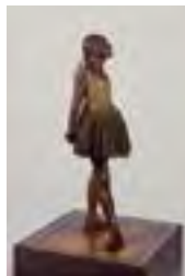
Little Dancer Aged 14 1880–1881 Edgar Degas (1834–1917) France Bronze, fabric UEA 2