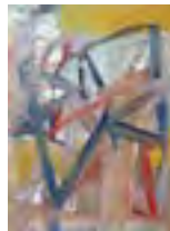
Study (Peregrine) Nick Powell

Details of all future shows and other news will be posted at: thelonelyartsclub.org.uk